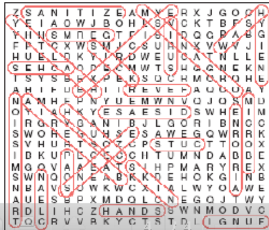
“Germ-Bustin’ Word Hunt”